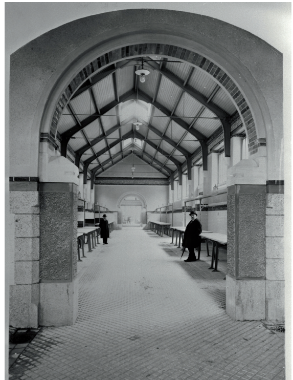
Halles Centrales in the 30's.

— 2 high-ceilinged rooms of 135m 2 and 25m 2 1 room of 12m 2 1 documentation and bookshop space —