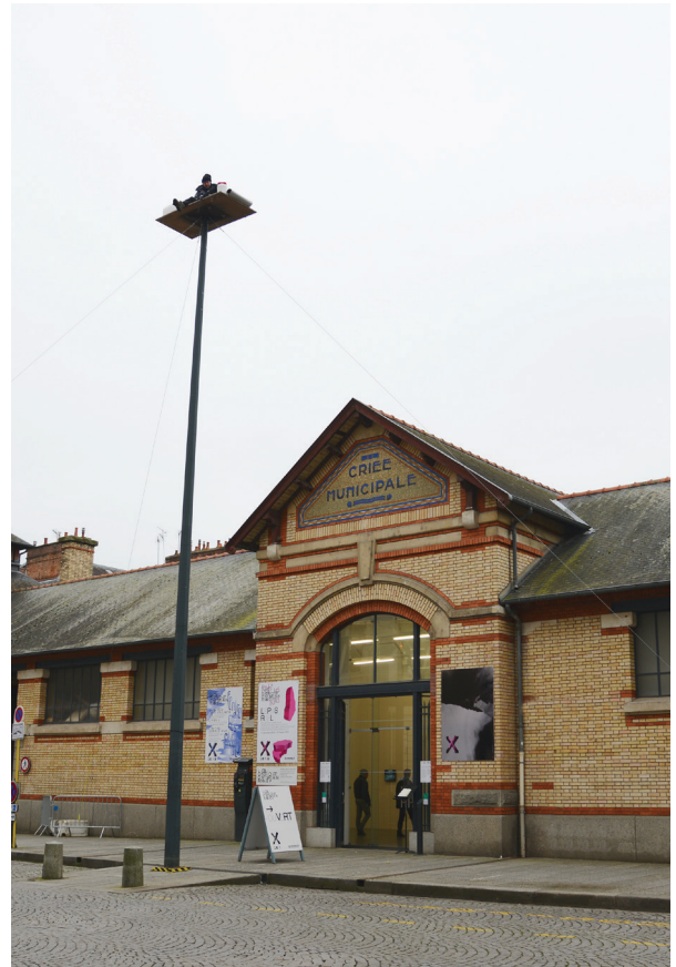
Abraham Poincheval, La Vigie urbaine , performance, 2016

For each new season the centre comes up with an ambitious programme of encounters and experiences on a local and global scale: exhibitions, art projects, research and multidisciplinary events.