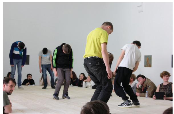
workshop in Yves Chaudouët, solo show, La Table gronde , 2015