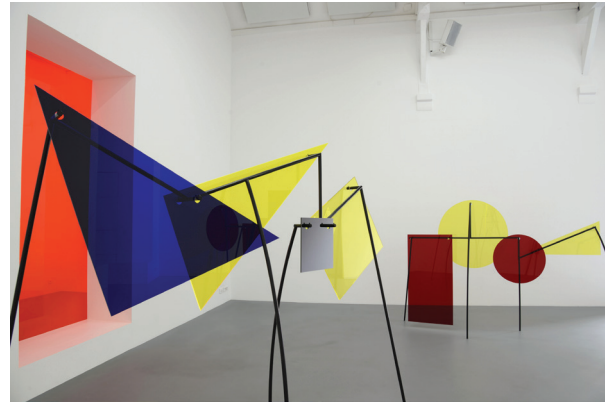
Amalia Pica, One Thing After Another , solo show, 2014

In addition to its "short-term" offers – guided tours, tours + workshops, art trails, etc. – each year La Criée proposes long-term transmission projects in connection with the production of works and in-depth contact with artists.