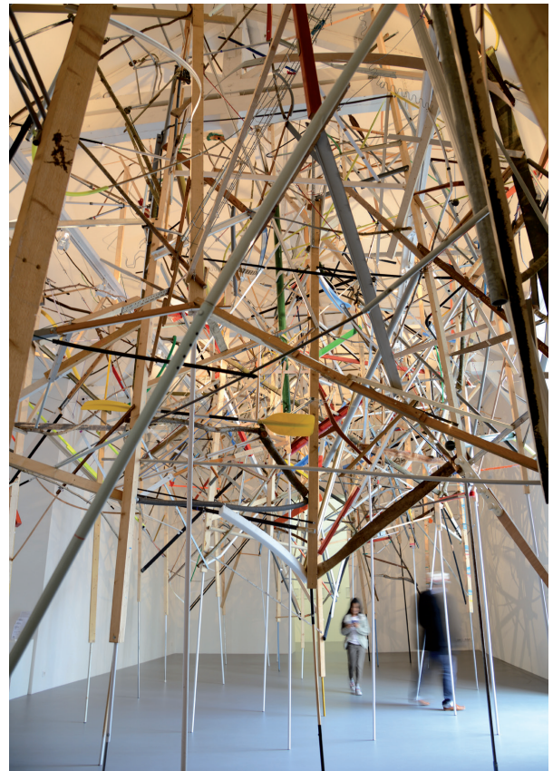
Jan Kopp, Un Grand Ensemble , solo show, 2013