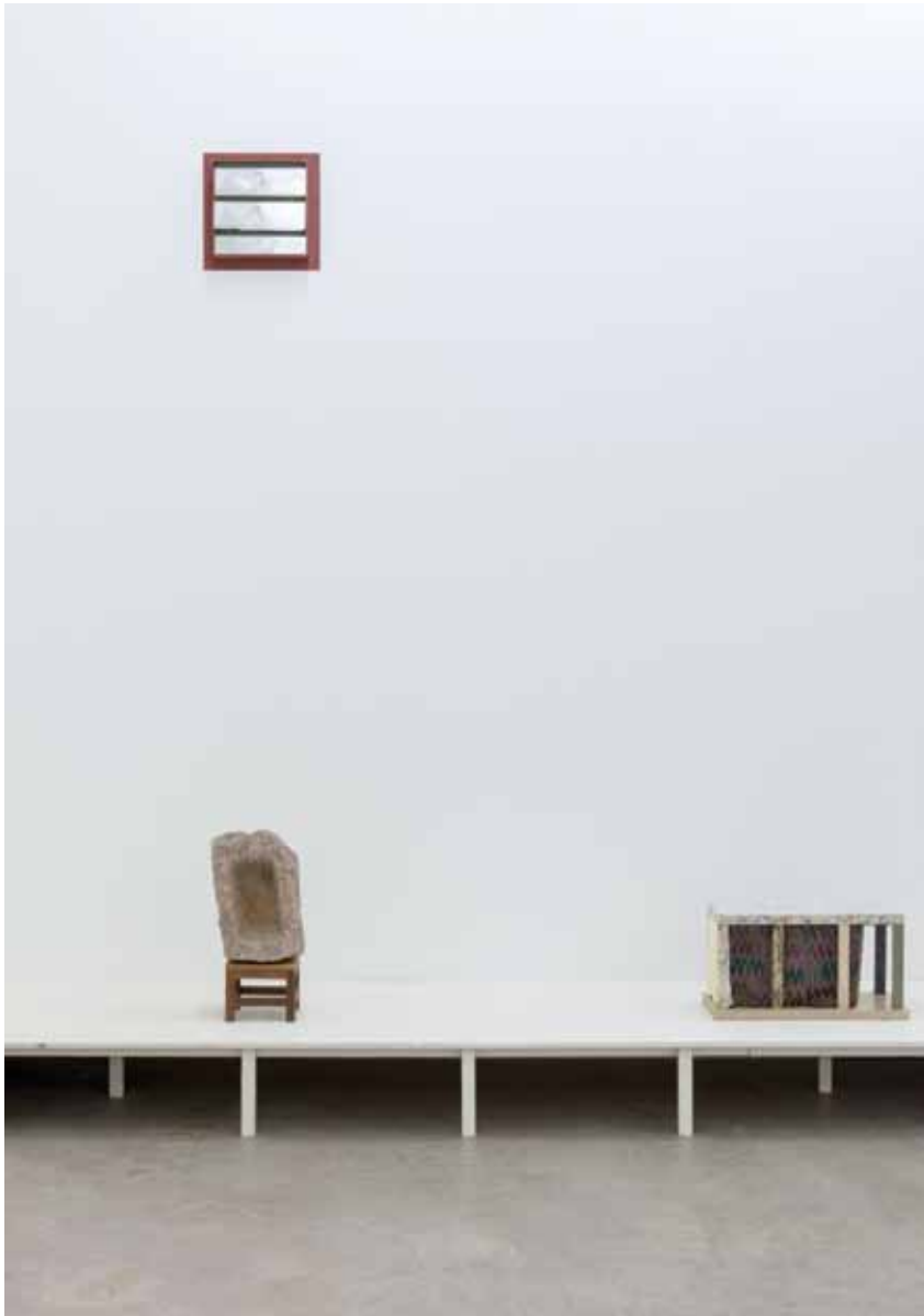
Gareth Moore, vue d'exposition, galerie Catriona Jeffries, Vancouver, 2013

Merci de respecter et de mentionner les légendes et les crédits photos lors des reproductions.