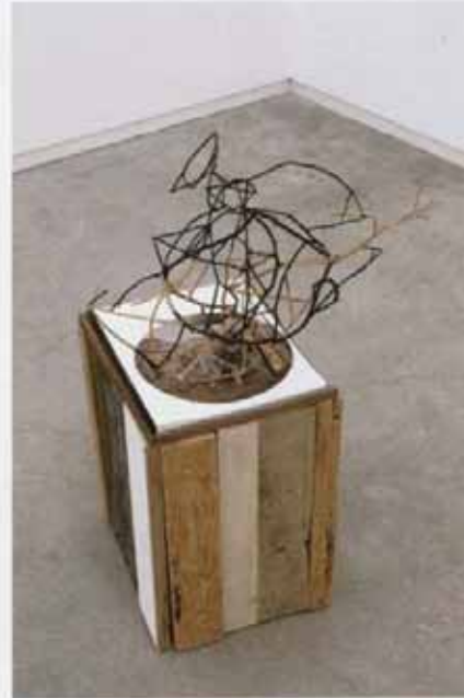
Left: Schuhvitrinen with Richard Long's shoes, 2006/2007 / Above: Der Landloper (from Uncertain Pilgrimage ), 2006/2007 / Opposite: Uncertain Pilgrimage: Crusoe Tells a Monnoecius Joke to Himself , 2006/2007

AB: Your other quiet intervention in the public sphere in Cologne at the Galerie Daniel Buchholz bookshop could be read as a metaphor for the whole project and indeed much of your work – a cabinet of curiosities in which varying narratives and histories and art and non-art objects come into close contact by means of forms of display that play with the tropes of museological display. What material did you bring together in Cologne?