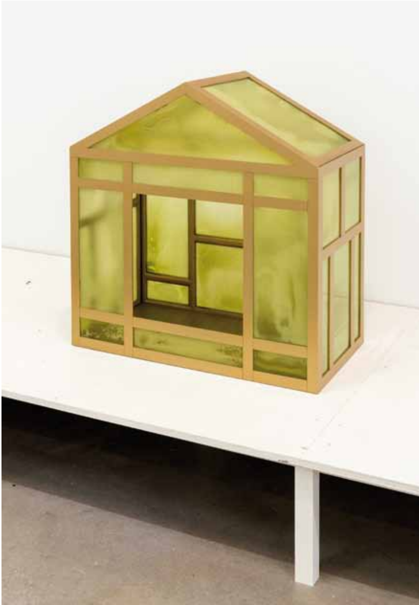
Gareth Moore, StGI-013 , 2013 Acier, verre, babeurre avec colorant alimentaire, mastic, contreplaqué 68,5 x 66 x 33 cm Courtesy de l'artiste et galerie Catriona Jeffries, Vancouver

Merci de respecter et de mentionner les légendes et les crédits photos lors des reproductions.