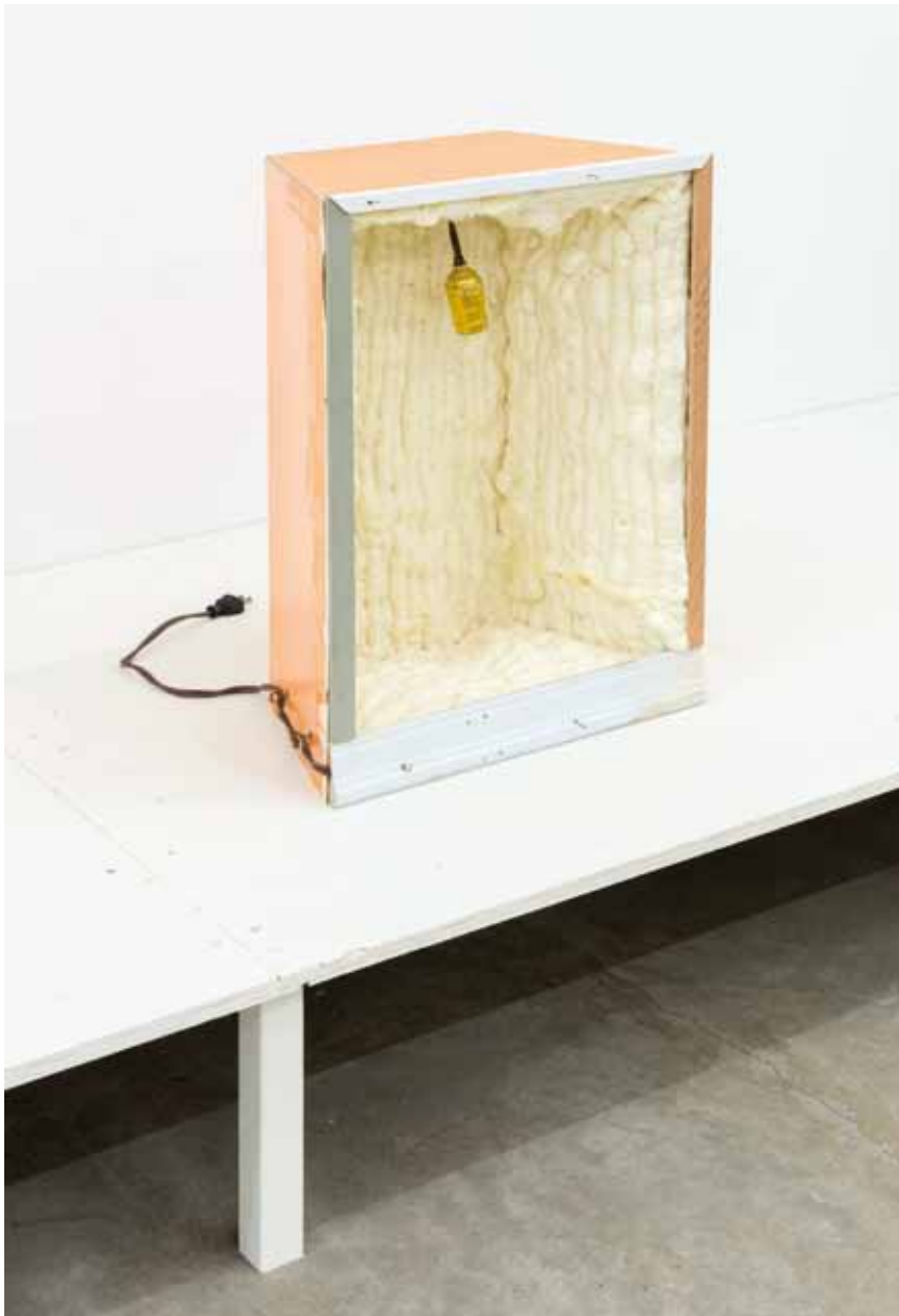
Gareth Moore, W-05e , 2013 Mousse expansive, bois aggloméré, barre d'angle en bois, clous, peinture, douille électrique avec prise 53,5 x 41 x 24 cm

Merci de respecter et de mentionner les légendes et les crédits photos lors des reproductions.