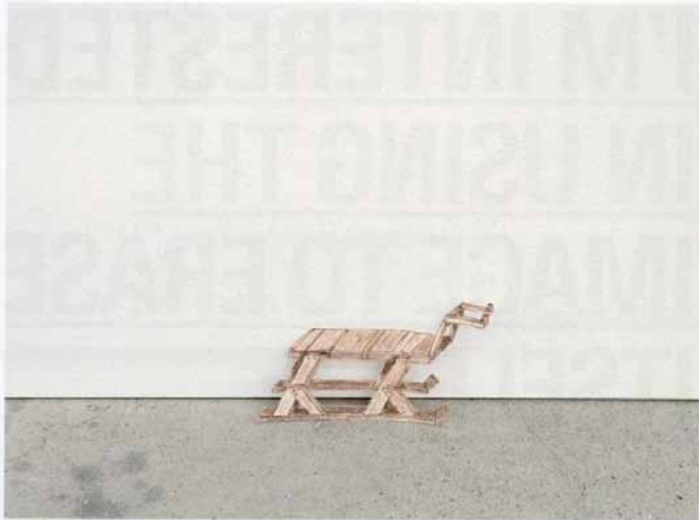
Uncertain Pilgrimage; Donkey (as sculptural companion) Sketch, 2007