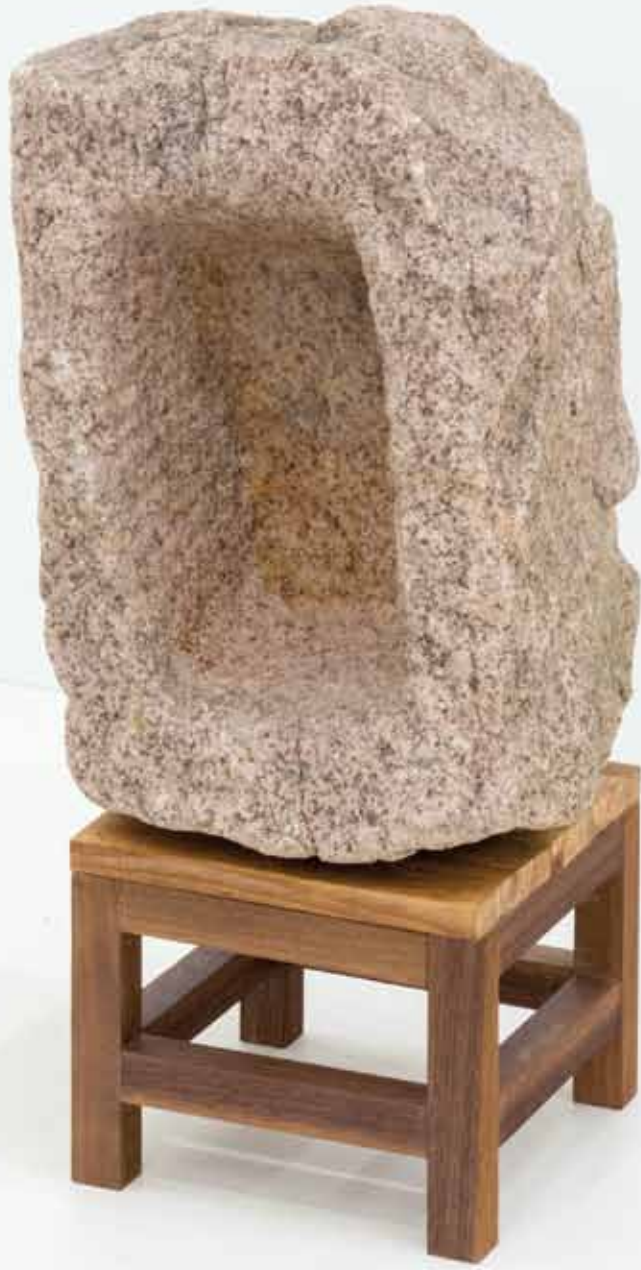
Identité visuelle © Lieux Communs / Image : Gareth Moore, Amrique Stone 03 , 2013. Granit ancien sculpté à la main, bois. Courtesy de l'artiste et galerie Caïtriona Jeffries, Vancouver. Battre la Campagne est le titre d'un recueil de Raymond Queneau © Éditions Gallimard