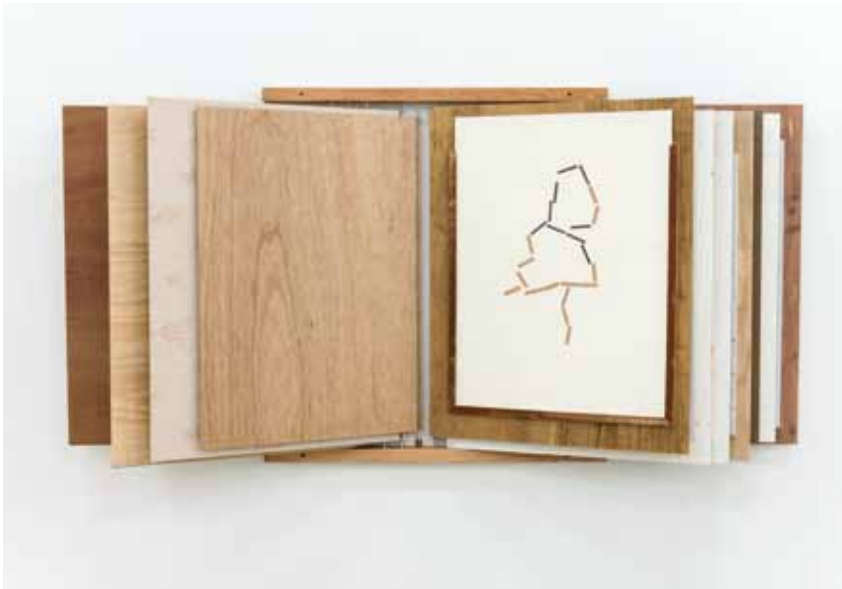
Gareth Moore, sans titre , 2013 Grattoirs à allumette sur papier 85 x 68,5 cm Collection privée, Cologne, Allemagne

Merci de respecter et de mentionner les légendes et les crédits photos lors des reproductions.