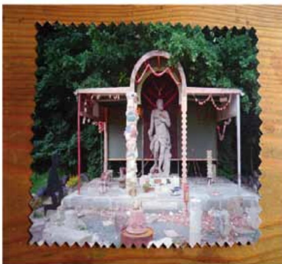
One of the serrated-edge postcards for sale at the kiosk for Gareth Moore's A place—near the buried canal (2010–12), where the structures are designed and executed not by DOCUMENTA (13) architects and carpenters, but by the artist himself.