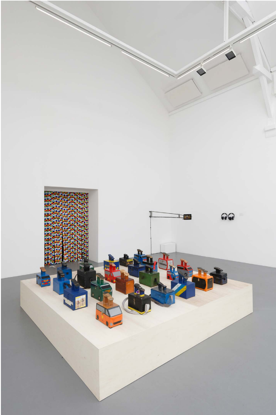
Bertille Bak, Dark-en-ciel , exhibition view, La Criée centre for contemporary, Rennes, 2022