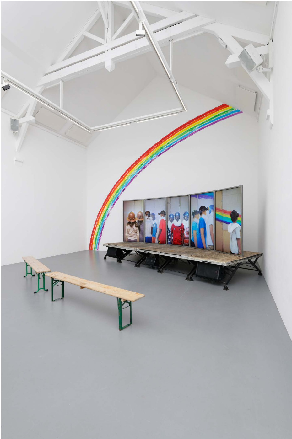
Bertille Bak, Dark-en-ciel , exhibition view, La Criée centre for contemporary, Rennes, 2022

— courtesy the artist, Xippas Gallery, Paris and The Gallery Apart, Rome photos: Aurélien Mole