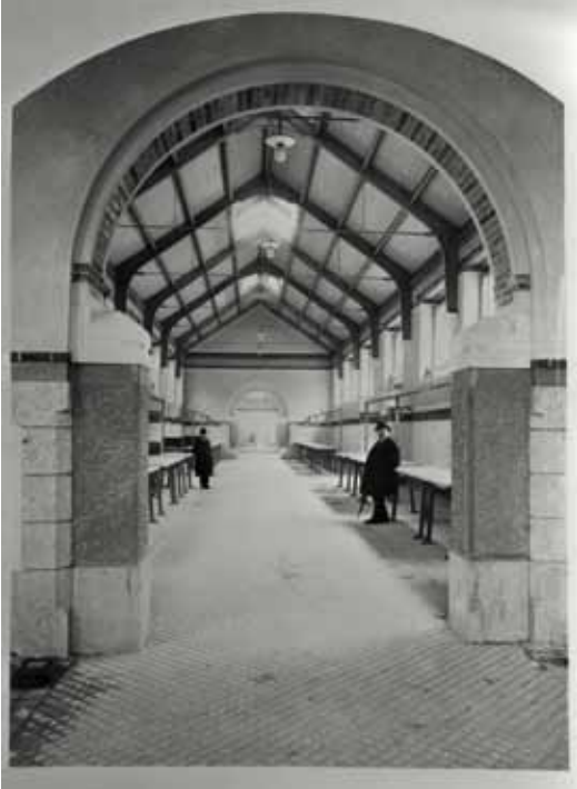
Interior view of the central market, Rennes, years 1920, Le Couturier (picture); Guy Artur (reproduction); Lambart Norbert (reproduction) © Région Bretagne, 1999