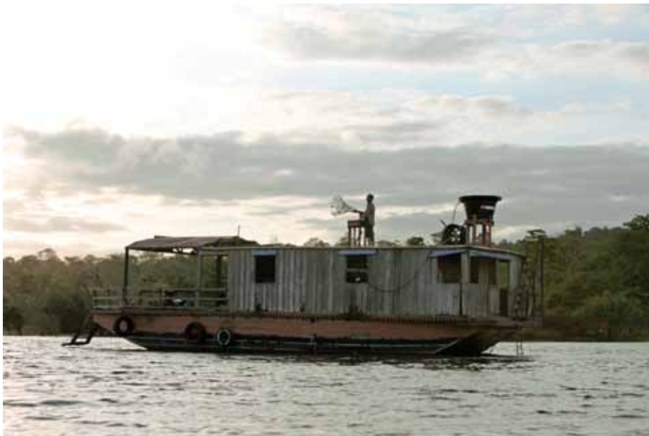
Caruso Inverso , performance, 2010 Video still, digital photo