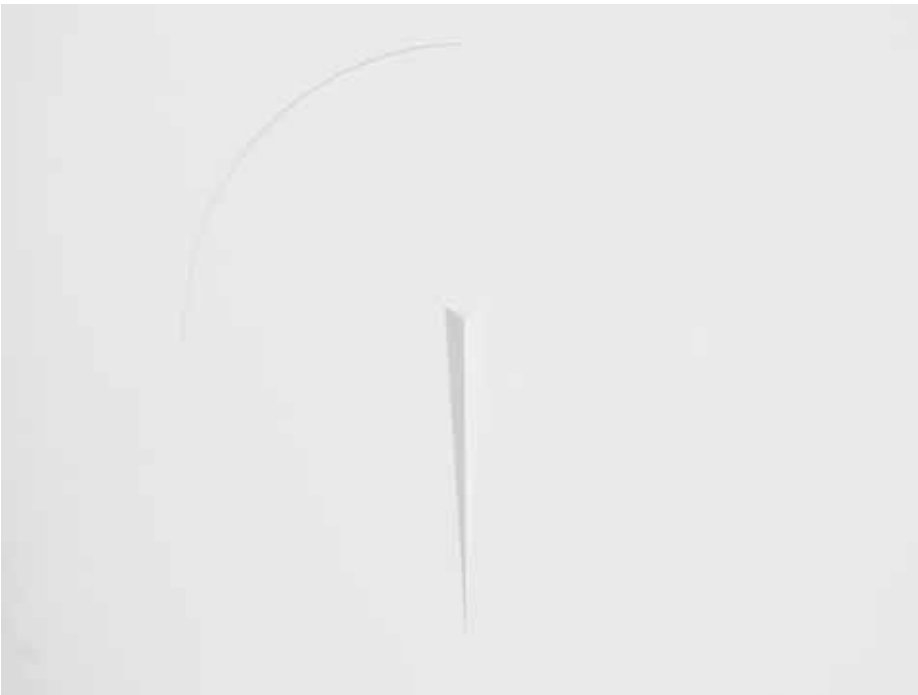
Untitled, 2013 Metal, white varnished