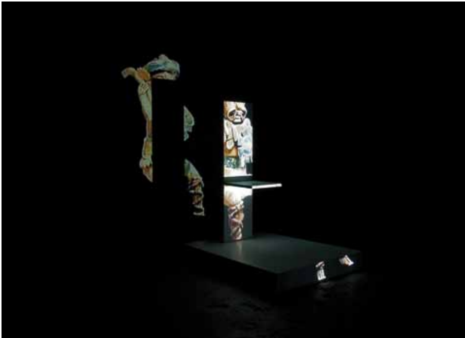
Gumpaste Incident , 2011 Wood, painted white cardboard, video-projection with sound