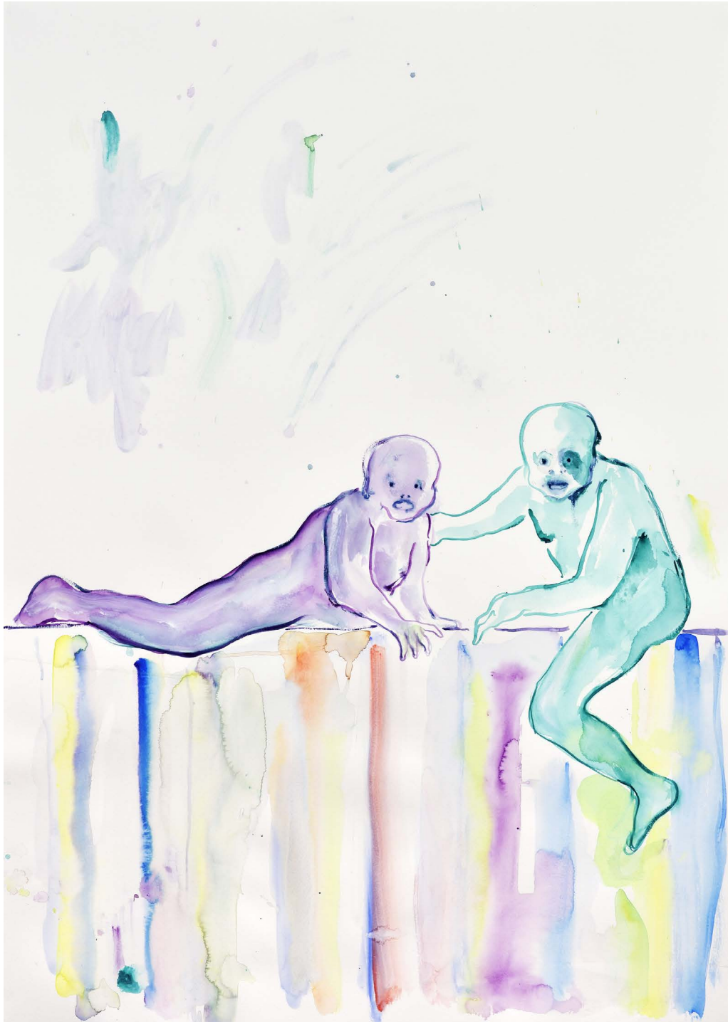
Vincent Gicquel, C'est pas grave #7 (No big deal #7) , watercolor on paper, 110 x 75 cm, 2018 production: La Criée centre for contemporary art, Rennes courtesy the artist and Thomas Bernard - Cortex Athletico, Paris – photo: Rebecca Fanuele