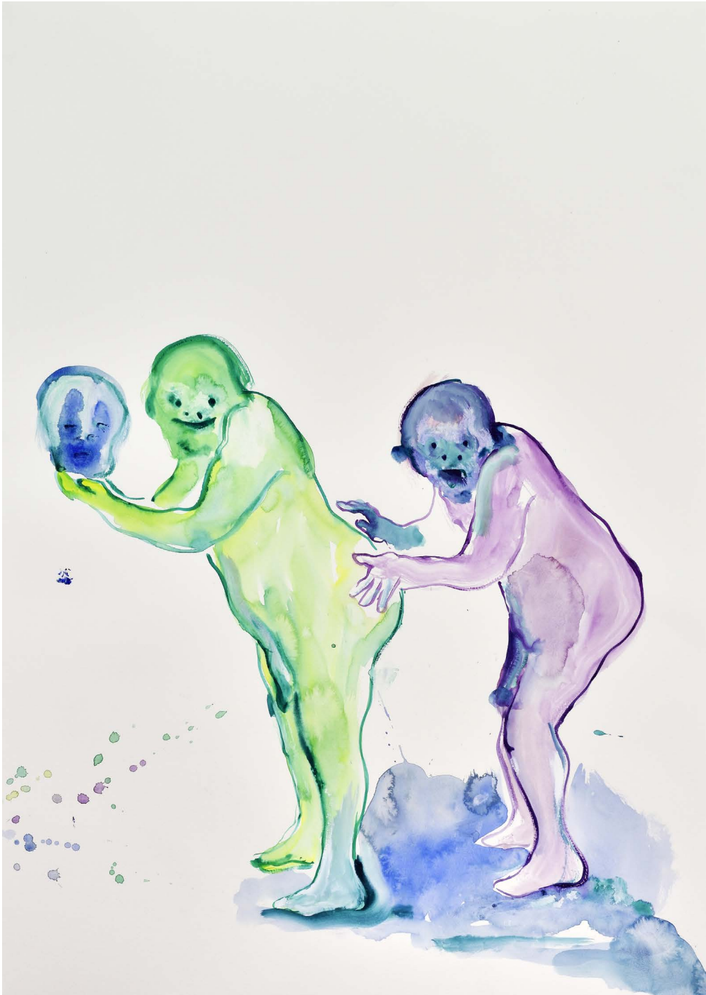
Vincent Gicquel, C'est pas grave #1 (No big deal #1) , watercolor on paper, 110 x 75 cm, 2018 production: La Criée centre for contemporary art, Rennes courtesy the artist and Thomas Bernard - Cortex Athletico, Paris – photo: Rebecca Fanuele