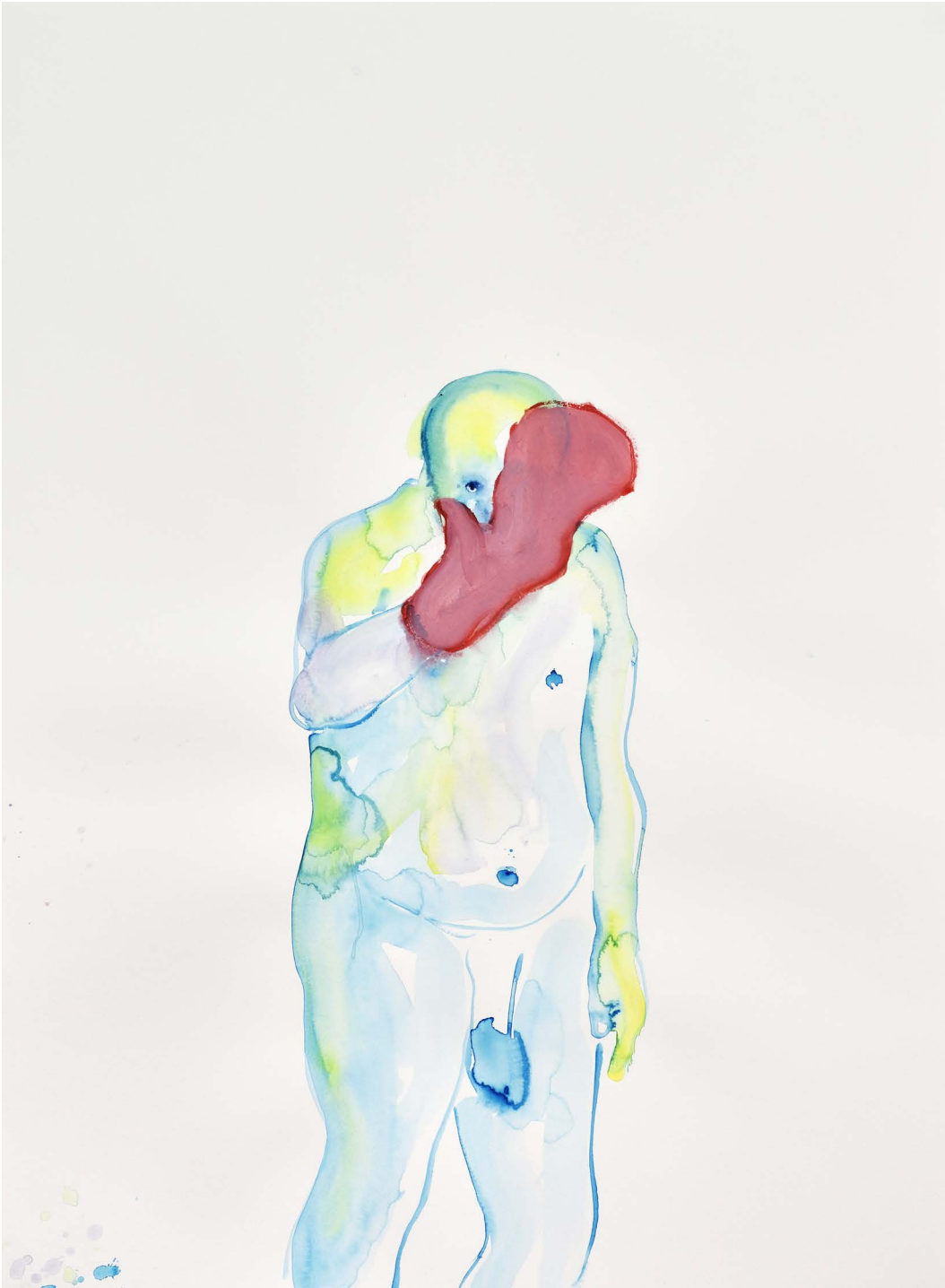
Vincent Gicquel, C'est pas grave #6 (No big deal #6), watercolor on paper, 110 x 75 cm, 2018 production: La Criée centre for contemporary art, Rennes courtesy the artist and Thomas Bernard - Cortex Athletico, Paris – photo: Rebecca Fanuele